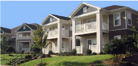
The Park at Oaklawn