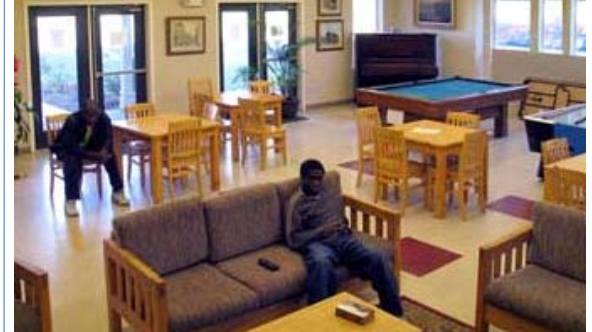
McCreesh Place Community Room

A call for a public hearing on the 2009-2010 Operating Budgets for the Authority to be held on February 17, 2009 was authorized.