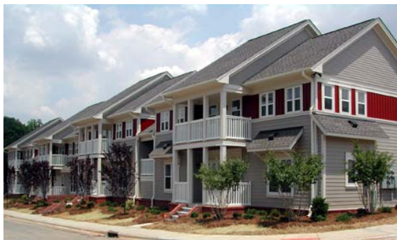
Arbor Glen Phase II

Consent was given to authorize the amendment for Arbor Glen to realign the budget to reflect the current phases being planned for the HOPE VI grant dollars.