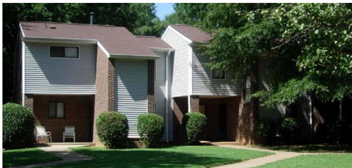
Live Oak Apartments